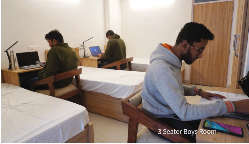
3 Seater Boys Room

The mess of the institute is spacious and equipped with comfortable dining furniture. It provides hygienic and nutritious food to the students. The students decide the weekly menu according to which meals are prepared and served. Mess staff is conscious about the cleanliness and quality of food in a hygienic manner.