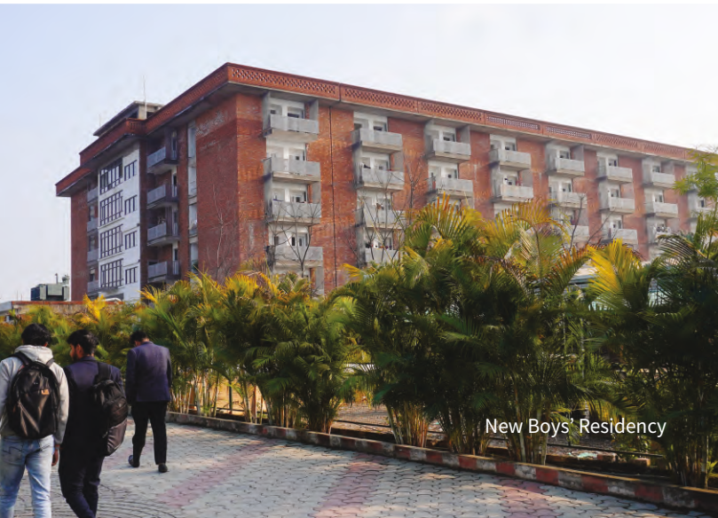
New Boys' Residency