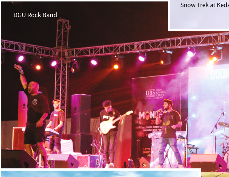
DGU Rock Band