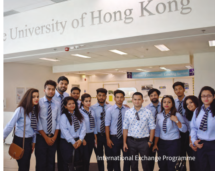
International Exchange Programme