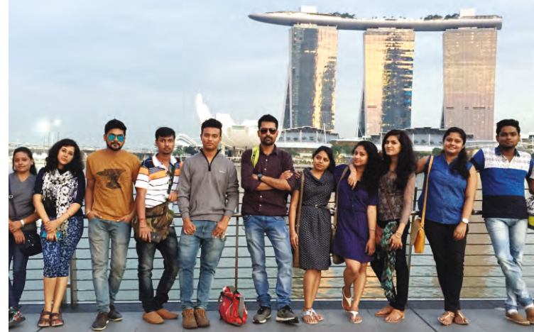
Students at Singapore