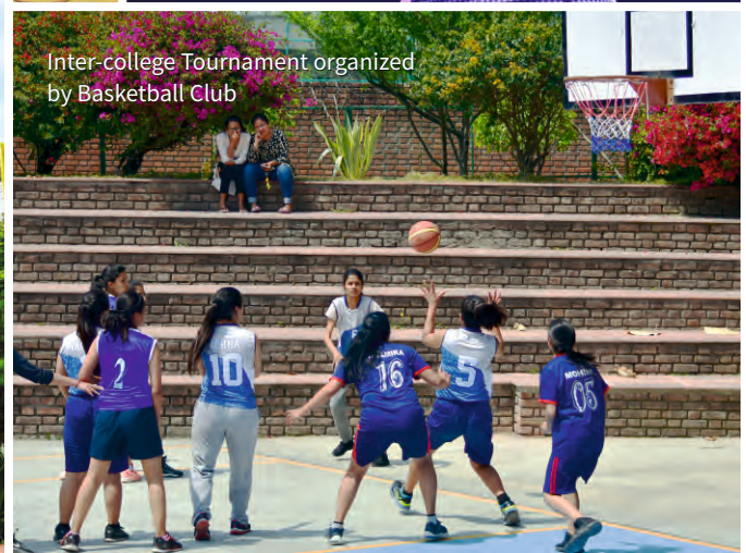
Inter-college Tournament organized by Basketball Club