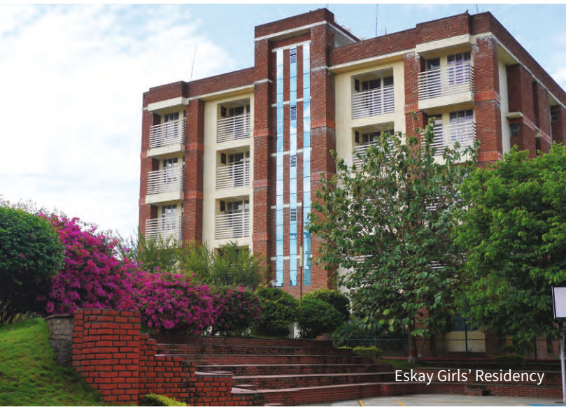
Eskay Girls' Residency