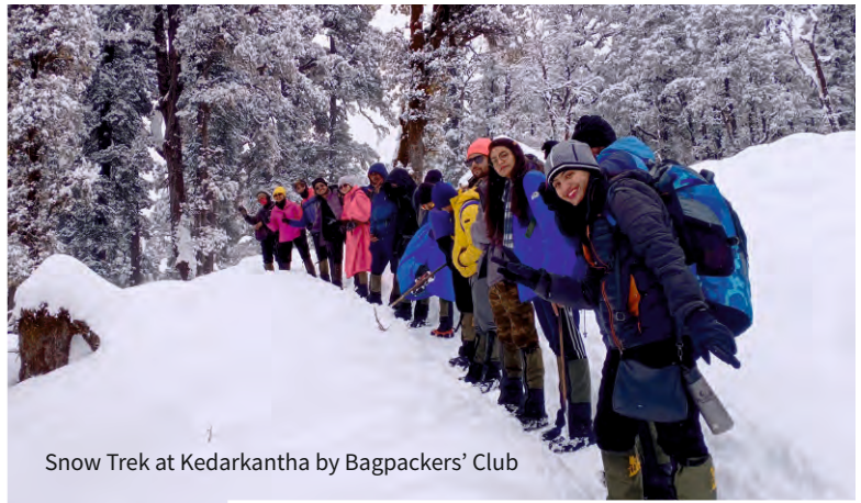
Snow Trek at Kedarkantha by Bagpackers' Club