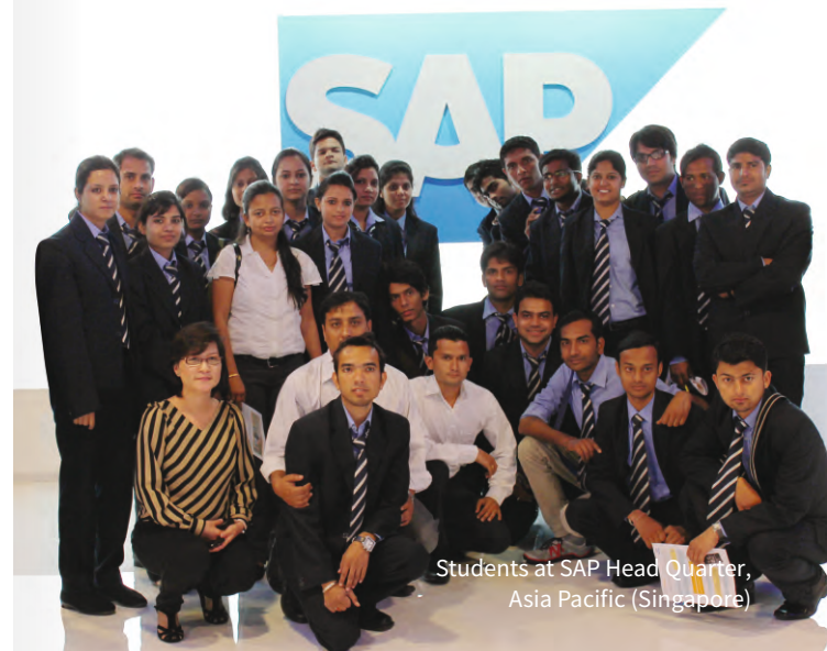
Students at SAP Head Quarter, Asia Pacific (Singapore)